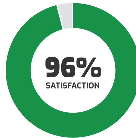
PLAN TO RENEW

A high renewal rate can be seen as an indicator of the level of satisfaction and the value a solution provides.